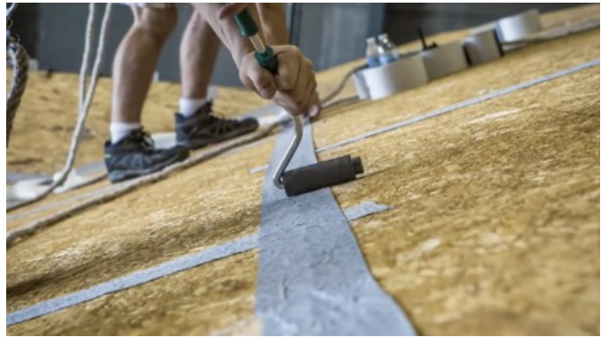
Figure 1. Installing a sealed roof deck system; taping the seams of roof sheathing.