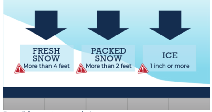
Figure 3. Snow and ice equivalent.