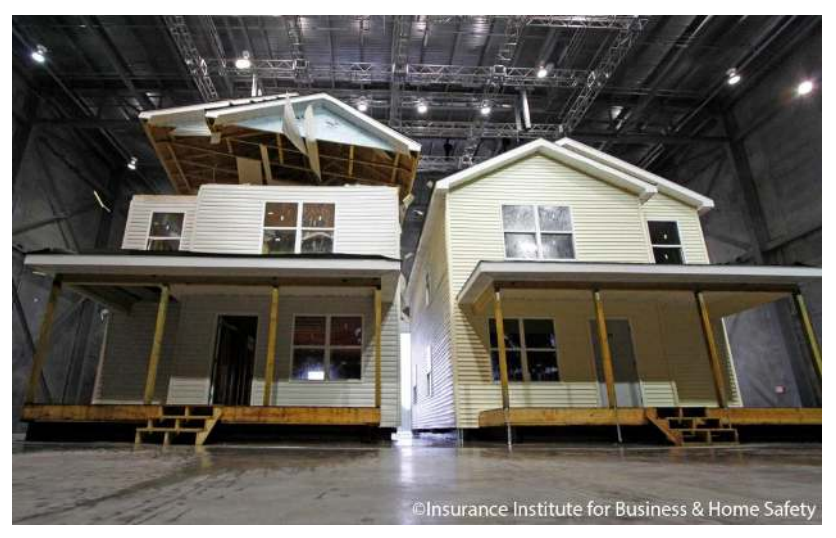
Figure 2: High wind test in the IBHS large test chamber. The home on the left was built to withstand gust wind speeds of 90 mph while the home on the right was built to the IBHS Fortified level and withstood more extreme wind conditions.

The adoption and enforcement of modern building codes in coastal communities is vital for mitigating the effects of extreme winds from a hurricane that makes landfall. Hurricane Andrew (1992) proved the dual need for stronger building standards coupled with adequate enforcement to ensure these codes are being met. Since then, more than two decades of sound scientific research has helped to influence the development of modern building codes