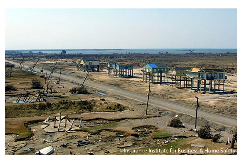
Figure 3: Homes on the Bolivar Peninsula following Hurricane Ike (2008). These structures were elevated above the 100-year flood level and built to the IBHS Fortified standard.

The Bolivar Peninsula east of Galveston was devastated by the storm surge associated with Hurricane Ike in 2008. Most homes that were built to the 100-year flood elevation or slightly above were completely destroyed by a storm surge approaching 16 feet with wave action extending peak water levels to nearly 20 feet above the ground (1–3 feet above the 100-vear occurrence level). At the time of Hurricane Ike's landfall, 13 homes on the Bolivar Peninsula had been constructed using the IBHS FORTIFIED for Safer Living®*